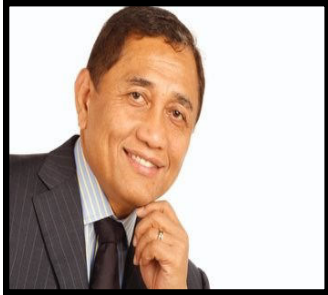
STRAIGHT FROM THE BELOVED PASTOR'S HEART