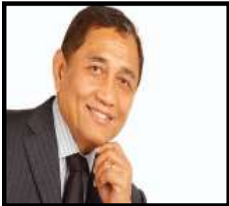
STRAIGHT FROM THE BELOVED PASTOR'S HEART

16 The Spirit itself beareth witness with our spirit, that we are the children of God: 17 And if children, then heirs; heirs of God, and joint-heirs with Christ; if so be that we suffer with him, that we may be also glorified together.