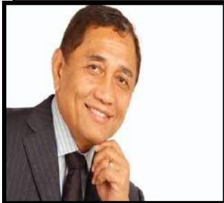
STRAIGHT FROM THE BELOVED PASTOR'S HEART