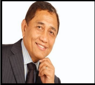
STRAIGHT FROM THE BELOVED PASTOR'S HEART