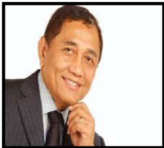
STRAIGHT FROM THE BELOVED PASTOR'S HEART

"But if ye turn unto me, and keep my commandments, and do them; though there were of you cast out unto the uttermost part of the heaven, yet will I gather them from thence, and will bring unto the place that I have chosen to set my name there."