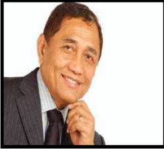
STRAIGHT FROM THE BELOVED PASTOR'S HEART

“And I looked, and rose up, and said unto the nobles, and to the rulers, and to the rest of the people, Be not ye afraid of them: Remember the Lord, which is great and terrible, and fight for your brethren, your sons and your daughters, your wives and your houses.”