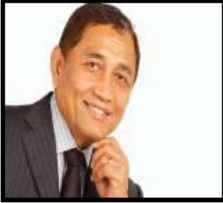
STRAIGHT FROM THE BELOVED PASTOR'S HEART

27 And at the dedication of the wall of Jerusalem they sought the Levites out of all their places, to bring them to Jerusalem, to keep the dedication with gladness, both with thanksgivings, and with singing, with cymbals, psalteries, and with harps. 43 Also that day they offered great sacrifices, and rejoiced: for God had made them rejoice with great joy: the wives also and the children rejoiced: so that the joy of Jerusalem was heard even afar off. —Nehemiah 12:27, 43—